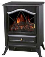
Matte Black #WES4215