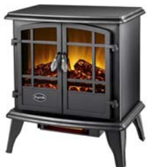
Antique Black #WEQS130